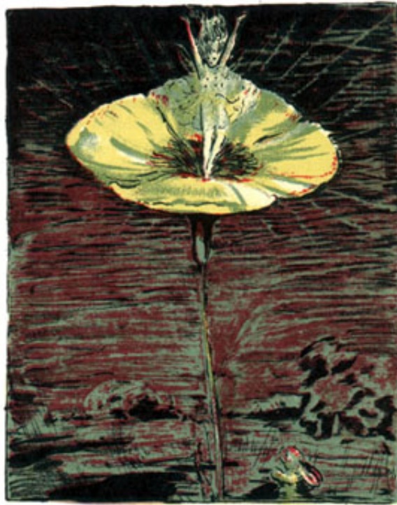
The Fairy Flower

And she held the little Rabbit close in her arms and flew with him into the wood.